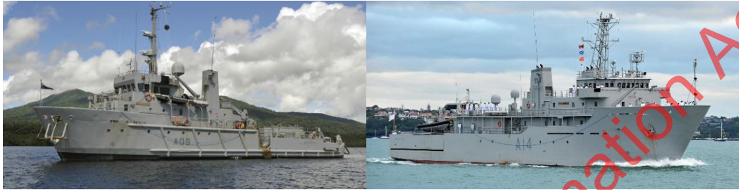
HMNZS Manawanui and Resolution

14. Cabinet recently agreed the Strategic Defence Policy Statement 2018, which updated New Zealand's Defence policy settings to align with the Government's foreign policy and national security priorities and reflect New Zealand's evolving strategic environment. This confirmed that the Government's highest priority for the Defence Force is its ability to operate and undertake tasks in New Zealand's territory and neighbourhood from the South Pole through to just below the equator. The Policy Statement also reinforced the role the Defence Force plays in contributing to New Zealand's broader national resilience and wellbeing, alongside its role in delivering military effects.