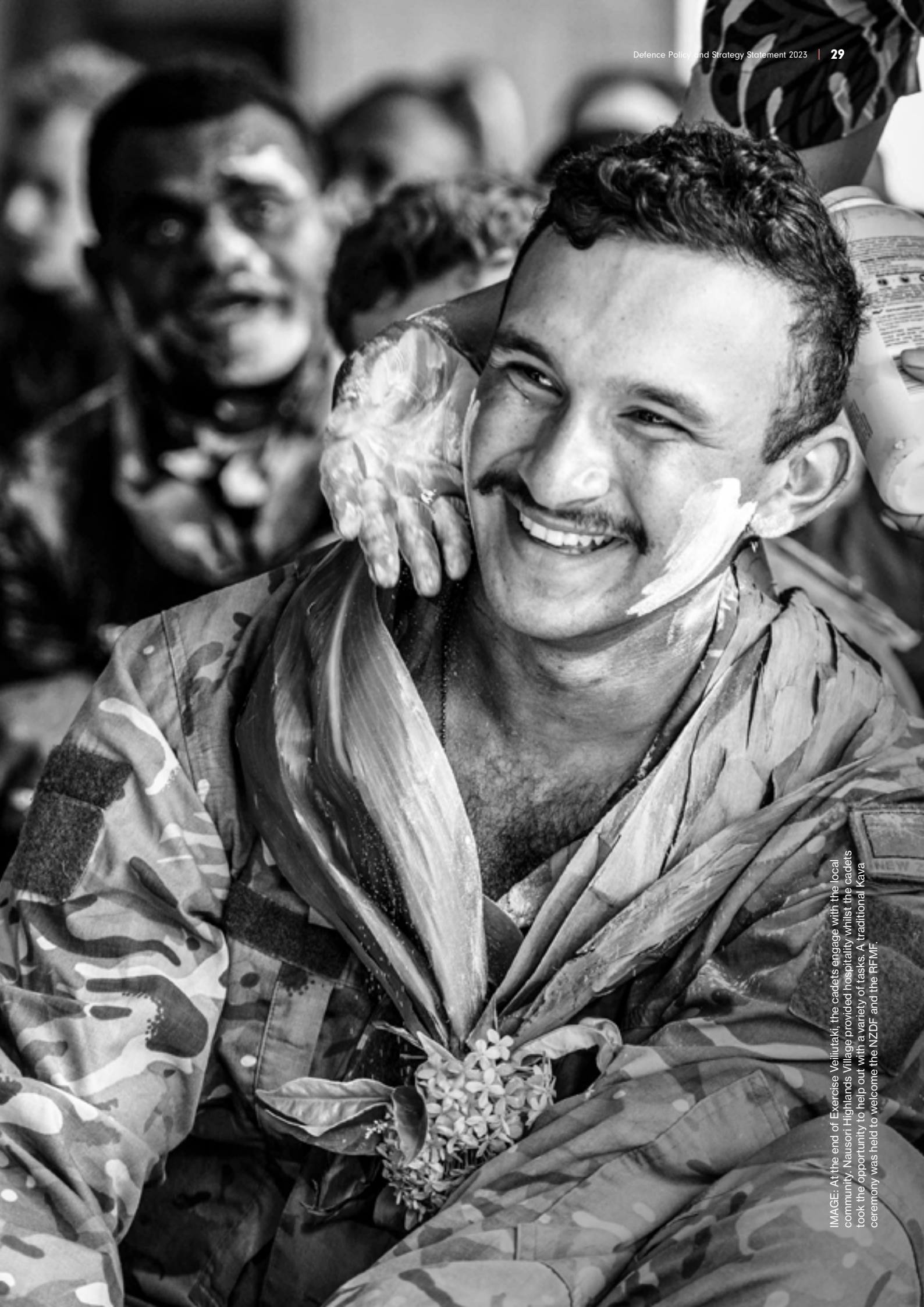
IMAGE: At the end of Exercise Veiiutaki, the cadets engage with the local community. Nausori Highlands Village provided hospitality whilst the cadets took the opportunity to help out with a variety of tasks. A traditional Kava ceremony was held to welcome the NZDF and the RFMF.