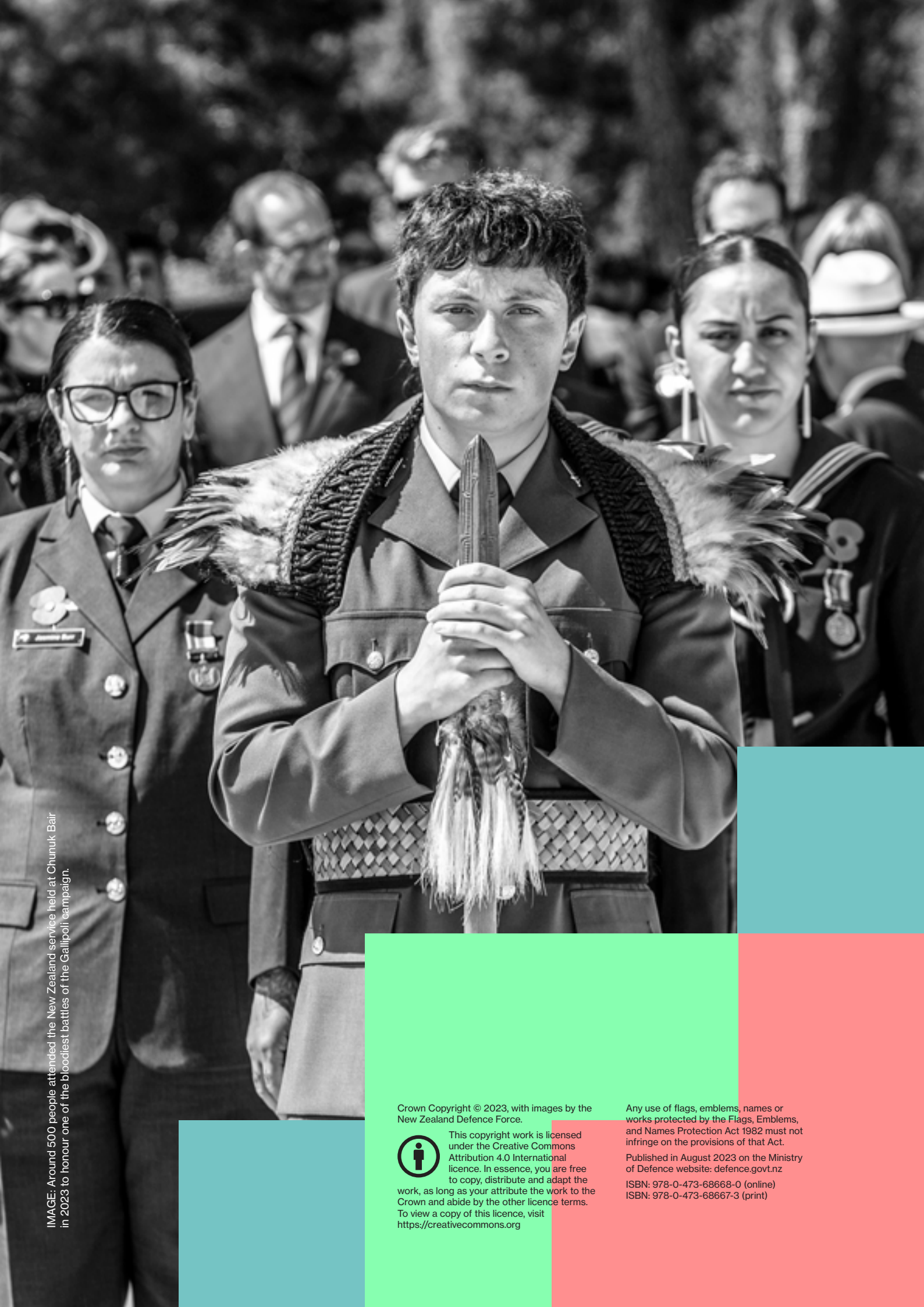
IMAGE: Around 5000 people attended the New Zealand service held at Churuk Bair in 2023 to honour one of the bloodiest battles of the Gallipoli campaign.